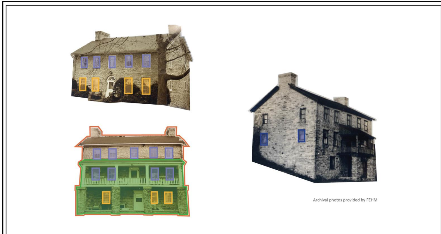
Archival photos provided by FEHM