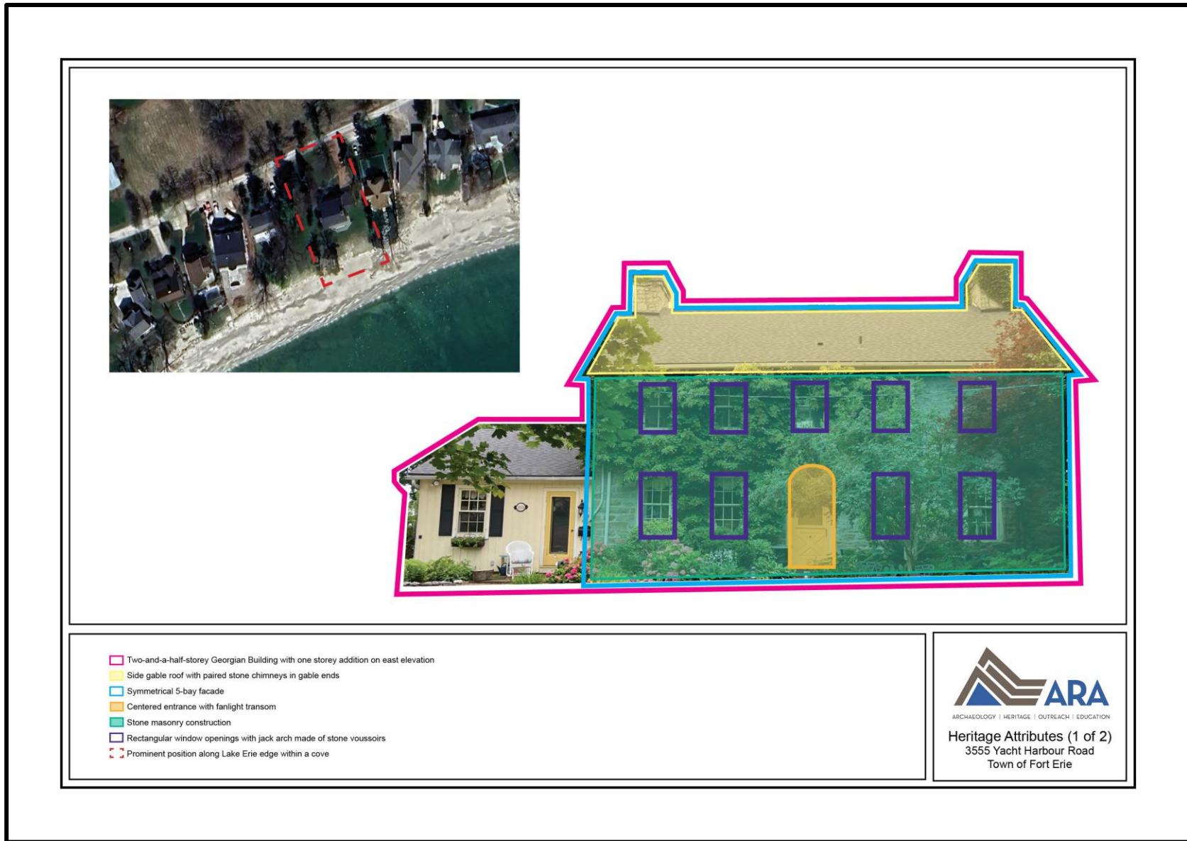
Map 3: Map of Heritage Attributes of 3555 Yacht Harbour Road